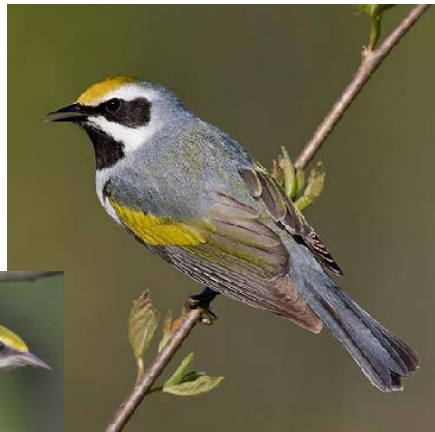
Paruline à ailes dorées : mâle; femelle

This small bird only weighs about 9 grams. The Golden-winged Warbler can be distinguished from other species by its yellow wing spot and crown. Males display a white breast, black throat and ear patch. Females are similar but duller, displaying shades of grey where the males are black and white.